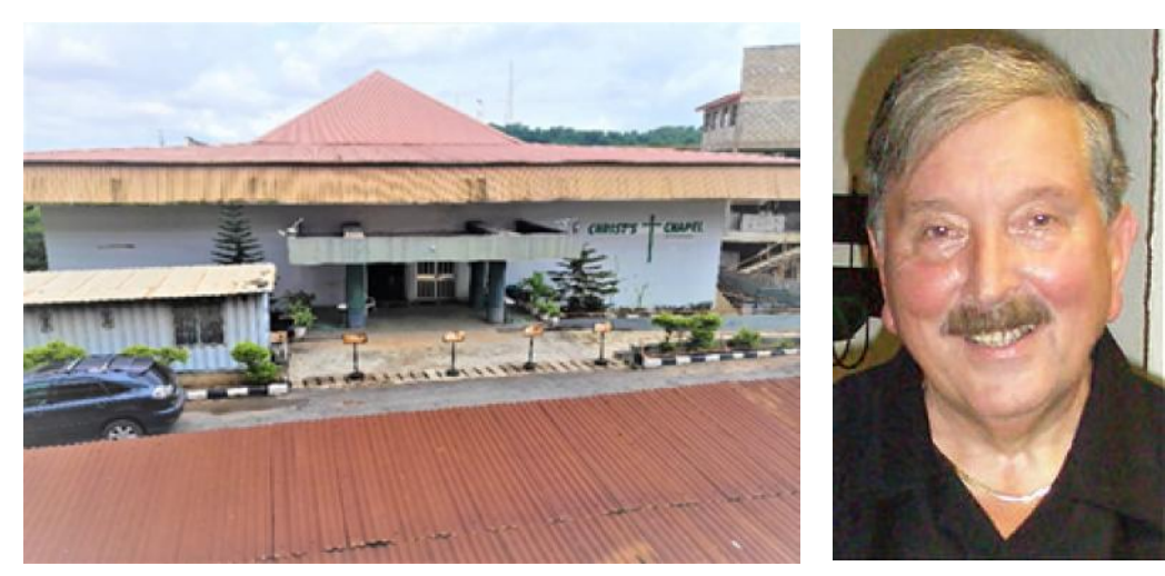
Christ Chapel, University College Hospital, Ibadan, Oyo State, Nigeria

I wish to acknowledge the sources of information used in this write up were obtained from the following websites: Edo state (https://en.wikipedia.org/wiki/ Edo_State), Amran Cohen (https://nmajmh.org/ education/individual-profiles/amram-cohen/), save a child foundation (https://saveachildsheart.org/ourhistory), Pan African Society of Cardiology (https:// www.pascar.org/content/page/history-of-pascar), European Society of Cardiology (https:// en.wikipedia.org/wiki/Aril_Edvardsen), Tribute to